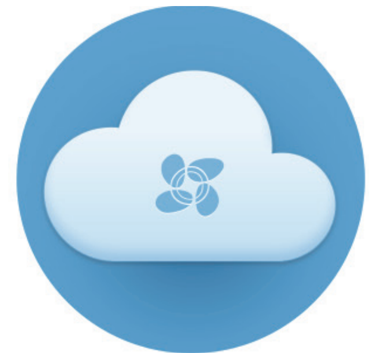
Encrypted Cloud Storage