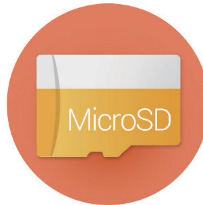
Supports MicroSD Card

Save your recordings with flexible and secured solutions. The DB1 comes with a built-in MicroSD card slot that can store up to 128 GB of recorded footage. You can also save your images to EZVIZ Cloud for additional back-up. (The EZVIZ CloudPlay is only available in the US, UK and Europe)