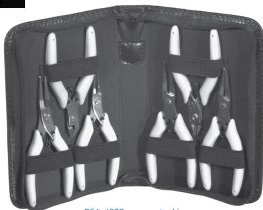
RFA-4080 — serrated jaws RFA-4081 — smooth jaws