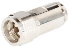
400PUM UHF Male for CNT-400 braided cable