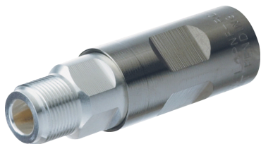
L4PNF-RC Type N Female RingFlare™ for 1/2 in LDF4-50A cable