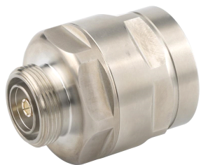
7-16 DIN Female EZfit® for 1-1/4 in FXL1480 and AVA6-50 cable