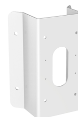
DS-1476ZJ-SUS Corner Mount