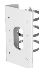
DS-1475ZJ-Y Vertical Pole Mount