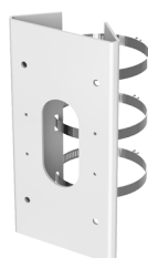
DS-1475ZJ-SUS Vertical Pole Mount