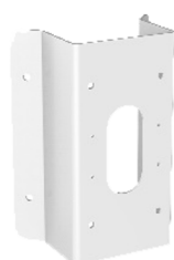
DS-1476ZJ-Y Corner Mount