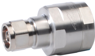
AL5NM-PSA Type N Male Positive Stop™ for 7/8 in AL5-50 and AVA5-50 cable