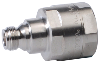
AL5NF-PSA Type N Female Positive Stop™ for 7/8 in AL5-50 and AVA5-50 cable